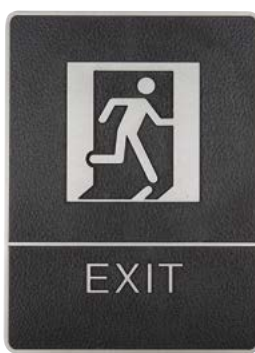
EXIT, braille signs. With double-side tape on the back.