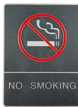
NO SMOKING, braille signs. With double-side tape on the back.