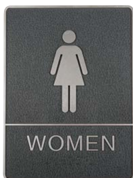
WOMEN, Braille signs. With double-side tape on the back.