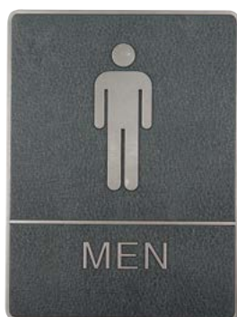
MEN, Braille signs. With double-side tape on the back.