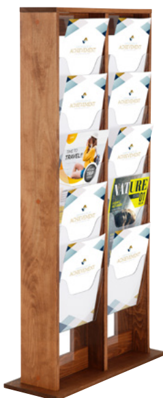
Dark Wood 2x5 8.5"x11"