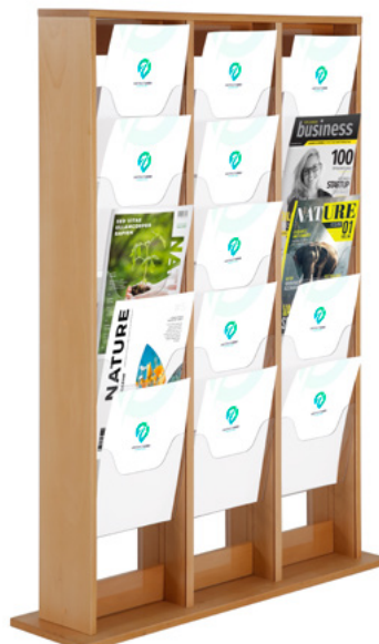
Natural Wood 3x5 8.5"x11"