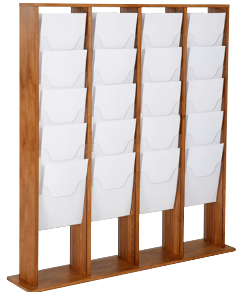
Dark Wood 4x5 8.5"x11"