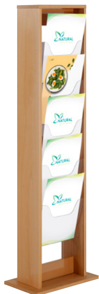
Natural Wood 1x5 8.5"x11"