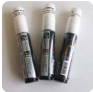
White chalkboard marker for Wood Display. 10 mm wide. 3 Pcs / UYAKLM1250