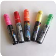
Colour chalkboard marker. 10 mm wide. 5 Pcs. / UYAKLM1251