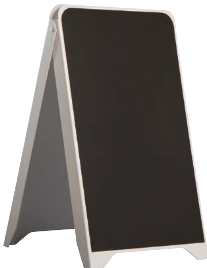
PS Chalk Board