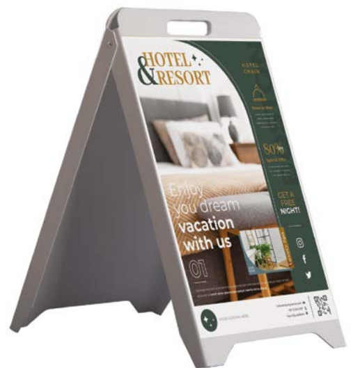
Carry PS Board